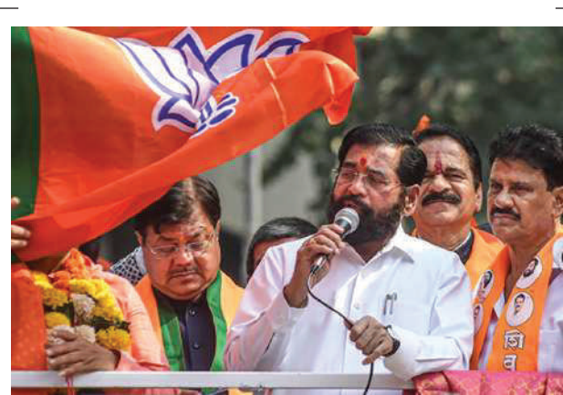
Maharashtra DyCM Eknath Shinde during a public rally for the upcoming BMC elections, in Mumbai

An FIR has been lodged and law enforcement agencies have been asked to investigate the case on priority and take strict legal action. Sonowal advised the public and media not to rely on or circulate the letter and to verify information only through official sources. His office earlier lodged a complaint at Parliament Street police station in New Delhi. The matter surfaced hours earlier on Monday evening.