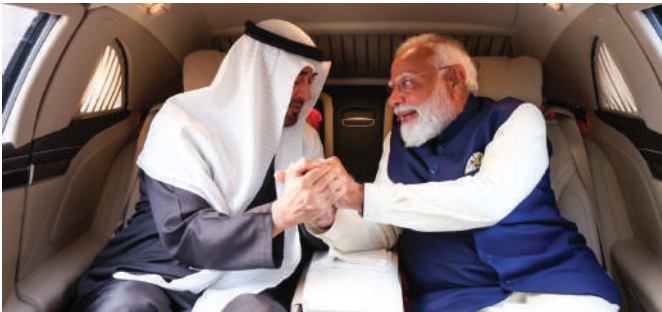
PM Narendra Modi receives UAE President Sheikh Mohamed bin Zayed Al Nahyan at Delhi airport and travels with him in a car

Of the five documents signed, the most significant was a letter of intent to establish a strategic defence partnership. The move,