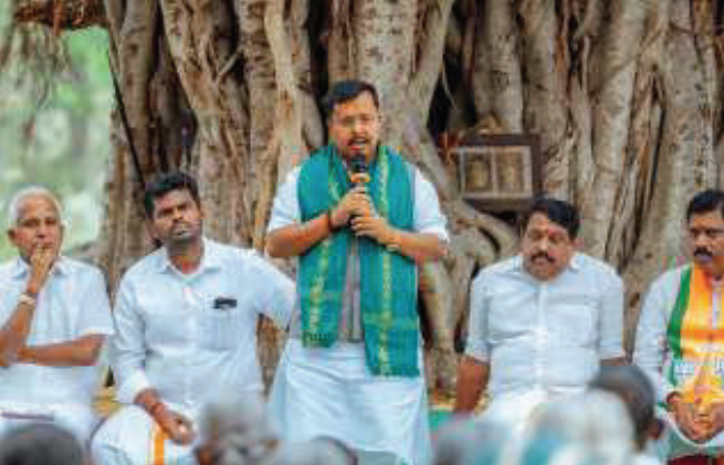
BJP National Working President Nitin Nabin addresses the beneficiaries of VB G-RAM-G Scheme on 11 January

M LA at 26 and BJP president at 45, Nitin Nabin's ascent has been nothing short of story-book. Elected unopposed on Monday as BJP's youngest National President, his elevation signals a clear generational shift as the party looks to further consolidate its grip on national politics. A low-profile but seasoned leader, Nabin is a five-term MLA from Bihar and the state's Public Works Department minister. He was appointed BJP working president on 14 December, a move that ended prolonged speculation over who would succeed veteran JP Nadda and surprised political circles amid buzz of differences between the BJP and its ideological mentor, RSS, over the appointment. The unassuming leader, who now has the task of steering the party through a packed electoral calendar, including Assembly elections in Tamil Nadu, Kerala and Assam due in April, has hit the ground running. The first BJP chief from Bihar, Nabin has toured several states since his appointment, delivering a sharp and direct message to party workers. "Politics is not a 100m race but a long marathon. It is not a test of speed but of patience and stamina," he has repeatedly told cadres. In Bihar, he urged workers to think