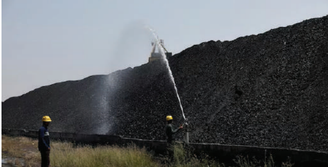
Employee's perform cooling operations where coal is stored at the NTPC (National Thermal Power Corporation) power plant in Solapur

At the national level, India meets nearly one-third of its electricity demand through thermal power and has committed to achieving net-zero emissions by 2070, alongside expanding renewable energy capacity to 500 gigawatts. However, government projections indicate that overall power demand will surge in the coming decade, requiring