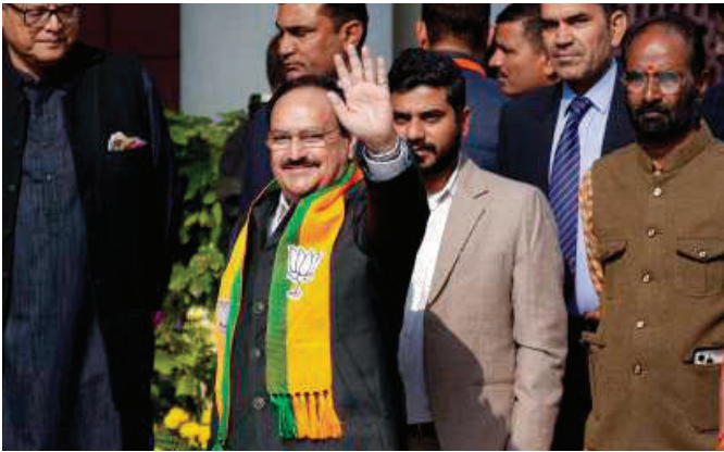
Union Minister and BJP National President JP Nadda arrives at party headquarters for the election of BJP's new National President

A fter Jagat Prakash Nadda took over as the BJP's 11th national president six years ago, rising steadily through the ranks over a period of three decades, Prime Minister Narendra Modi had expressed confidence that the party would scale new heights under his leadership. True to that trust, Nadda delivered a notable legacy, leading the party as it consolidated strongholds and expanded its footprint despite occasional setbacks, before handing over the baton to his successor Nitin Nabin, elected unopposed as the new BJP Chief on Monday. During his tenure, the BJP secured a series of wins in the assembly polls. While the party wrested Madhya Pradesh, Chhattisgarh and Rajasthan from the Congress, it ended Naveen Patnaik's 24-year rule as Odisha chief minister by decimating the BJD in the assembly elections. Under Nadda's stewardship, the BJP also returned to power in Delhi in 2025 after more than 26 years by inflicting a crushing defeat on the Arvind Kejriwal-led AAP in the assembly polls. The BJP stormed to power in Haryana for a third consecutive term and pulled off a stunning performance in Maharashtra, winning a