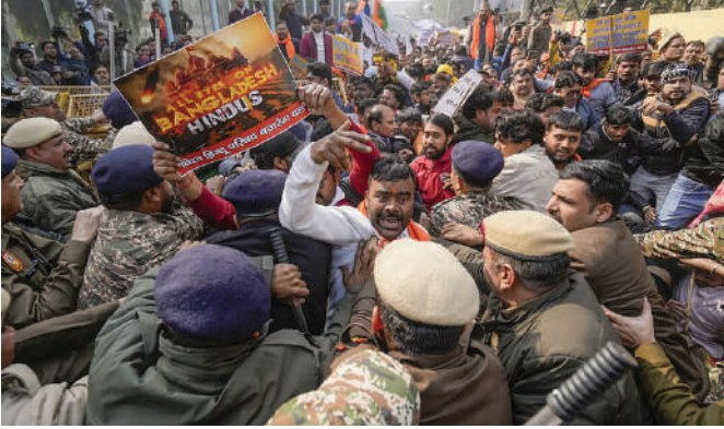
Police try to stop Vishwa Hindu Parishad and Bajrang Dal activists as they protest outside the High Commission in Bangladesh