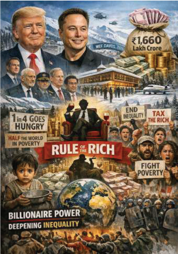
Oxfam said the billionaire wealth jumped by over 16 per cent in 2025, while it has increased by 81 per cent since 2020