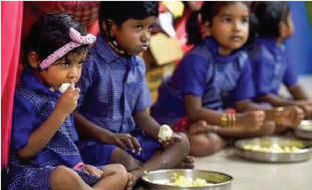
Nearly 95 per cent of the protesters are women, many from rural and tribal areas, who say their labour keeps classrooms running, even as their own households remain on the brink