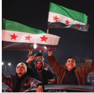
People celebrate as Syrian government take control of the town from the Democratic Forces

lations "by these people desecrating a house of worship," adding, "A house of worship is not a public forum for your protest." Attorney General Bondi said any federal law violations would be prosecuted.