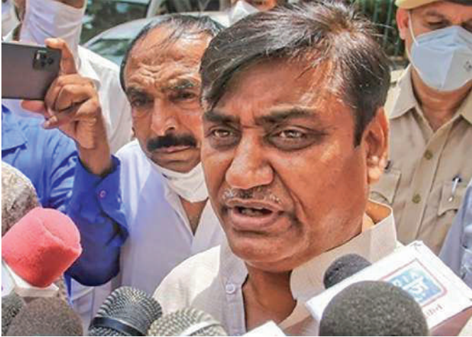
Rajasthan Congress chief Govind Singh Dotasra

"Until 3 January, there was no chaos, and the entire system was running smoothly. However, on 3 January, BJP's National General Secretary (Organisation) BL Santosh