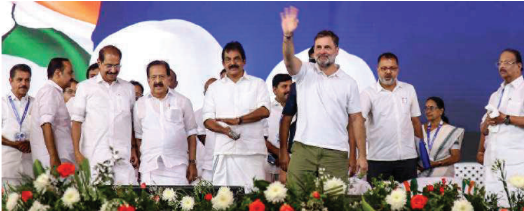
LoP in the Lok Sabha and Congress leader Rahul Gandhi during a Mahapanchayat of newly elected party local body representatives, in Kochi, on Monday