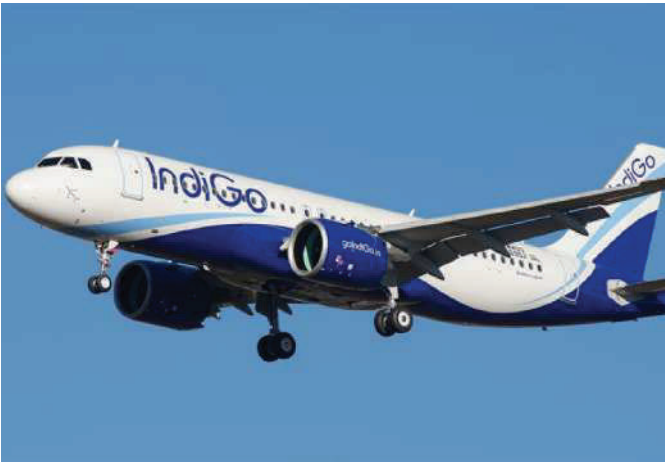
Indigo's services were disrupted nationwide last month creating problems for passengers

The Federation of Indian Pilots, FIP, on Monday criticised aviation regulator DGCA for imposing a 'very meagre' penalty of Rs 22.20 crore on IndiGo for the large-scale flight disruptions that impacted lakhs of travellers in December, saying that the safety of passengers and aircraft cannot be 'traded off.' FIP questioned the flight cancellation period considered in the probe by the regulator, and said the penalty amount is "very, very meagre." The DGCA on Saturday announced the enforcement actions after a detailed probe. It slapped penalties totalling Rs 22.20 crore on IndiGo for cancelling thousands of flights in early December, and warned airline CEO Pieter Elbers and COO Isidre Proqueras. It also ordered the removal of the Senior Vice President for Operations Control centre (OCC), Jason