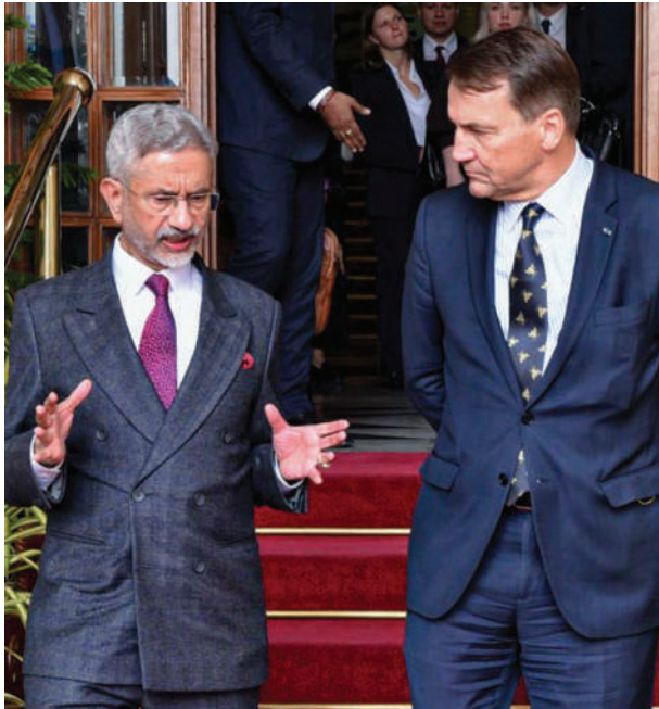
External Affairs Minister S Jaishankar with Poland's Deputy Prime Minister Radoslaw Sikorski in New Delhi on Monday