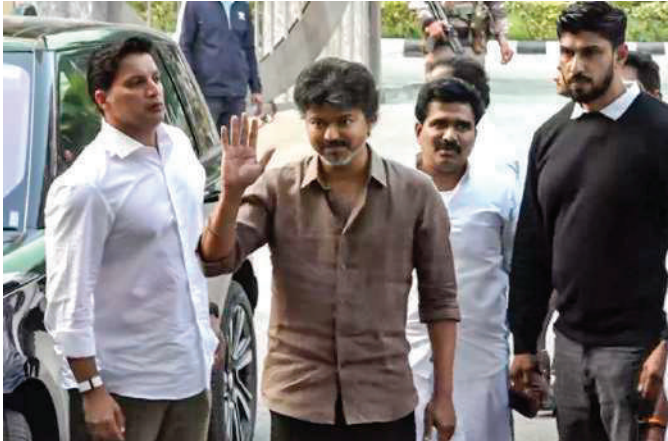
TVK Chief and actor Vijay leaves from CBI headquarters after 6 hours of questioning linked to the Karur stampede case, in New Delhi

Several questions related to decision-making about the rally, reasons for his delay, continuation of speech, his knowledge about the chaos, turnout and mismanagement of the crowd were put forth to him, they said.