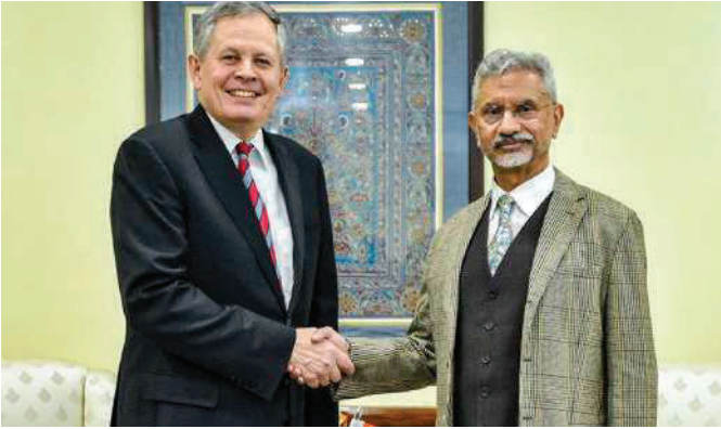
United States Senator Steve Daines with External Affairs Minister S Jaishankar during a meeting, in New Delhi

In late October, Sikorski travelled to Islamabad and held wide-ranging talks with Pakistan Foreign Minister Ishaq Dar, following which a joint statement was issued that featured the Kashmir issue.