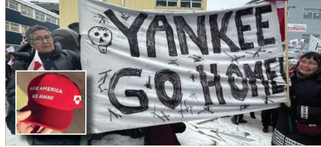
Pro-Greenland protesters at a rally, another mocks Trump's MAGA slogan with 'Make America Go Away' cap