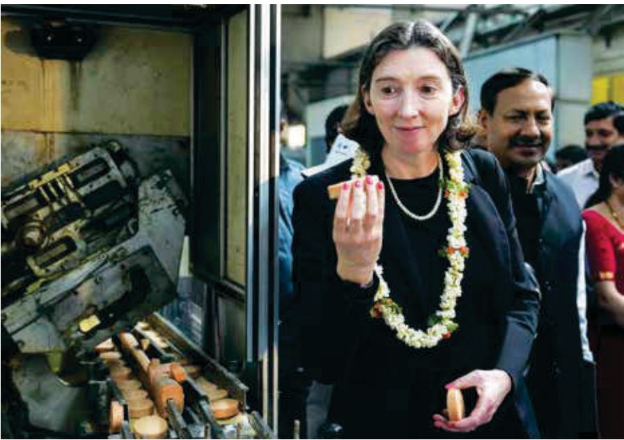
British High Commissioner to India Lindy Cameron during a visit to Karnataka Soaps at its manufacturing complex in Bengaluru on Wednesday.

Mumbai: Equity benchmark indices Sensex and Nifty surged over 1 per cent on Thursday, taking their winning momentum to the third day running, amid growing optimism following easing geopolitical tensions and buying in market heavyweights HDFC Bank and Reliance Industries. The 30-share BSE Sensex jumped 1,000.36 points or 1.21 per cent to settle at 83,755.87. During the day, it surged 1,056.58 points or 1.27 per cent to 83,812.09. The 50-share NSE Nifty rallied 304.25 points or 1.21 per cent to 25,549. From the Sensex constituents, Tata Steel, Bajaj Finance, Bharti Airtel, Adani Ports, Eternal, Bajaj Finserv, NTPC, HDFC Bank, Reliance Industries and Axis Bank were among the major gainers. In contrast, Trent, State Bank of India, Tech Mahindra, Maruti and Mahindra & Mahindra were among the laggards. In Asian markets, Japan's Nikkei 225 index settled higher, while South Korea's Kospi, Shanghai's SSE Composite index and Hong Kong's Hang Seng ended lower. European markets were trading in the green in mid-session deals. US markets ended on a mixed note on Wednesday. Global oil benchmark Brent crude climbed 0.18 per cent to USD 67.80 a barrel. Foreign Institutional Investors (FIIs) offloaded equities worth Rs 2,427.74 crore on Wednesday, while Domestic Institutional Investors (DII) bought stocks worth Rs 2,372.96 crore, according to exchange data.