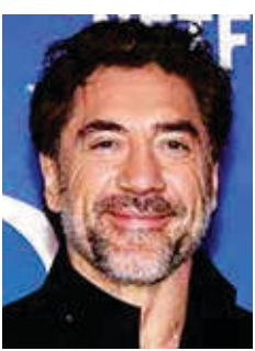
Javier Bardem, Actor

"I couldn't really get much of the culture, of the land, of the people in India. But of course, I'm interested in such a huge, important part of the world that has so much effect on a lot of things, among them spirituality."