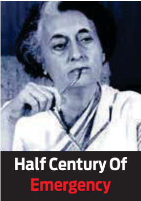
Half Century Of Emergency

WHAT LED TO A BAN ON GULZAR’S ‘AANDHI’ DURING EMERGENCY