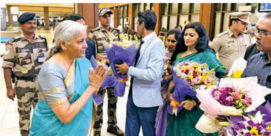
Union Finance Minister Nirmala Sitharaman being welcomed upon arrival in Gandhinagar in Gujarat on Thursday.