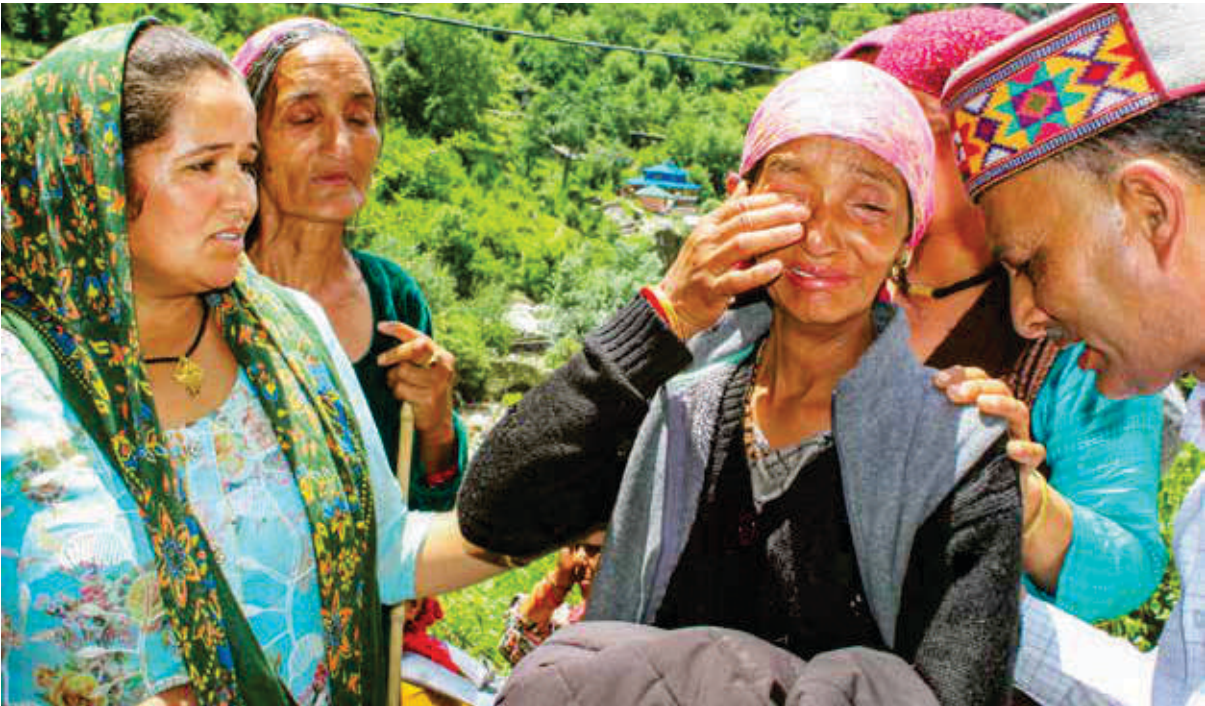
People mourn after their family members were swept away in the lash loods triggered by cloudbursts on Wednesday, in Sainj vally of Kullu district.

“Gujral sahib told me that it was Sanjay (Gandhi) who had not taken the controversy well. Otherwise, there was no objection from the others. I remember my reply too, that it was just one of those things which happens in a democracy.”