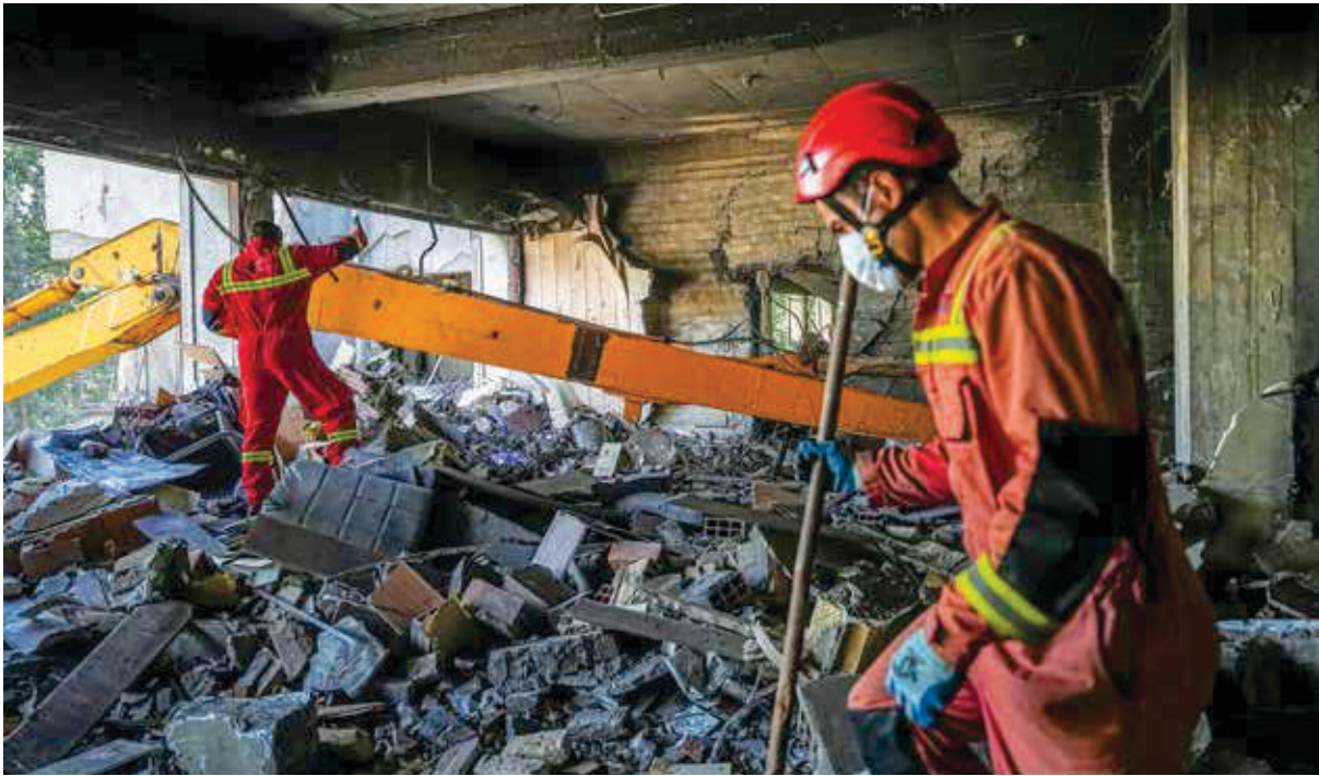
Rescuers search through the rubble of a damaged section of Evin Prison following an Israeli strike the day before in Tehran, Iran.

While he did not seek approval, Trump sent congressional leaders a short letter Monday serving as his official notice of the strikes, two days after the bombs fell.