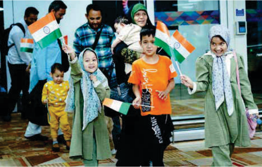
Indian nationals who were evacuated from Iran under Operation Sindhu arrive at the Delhi airport on Thursday.