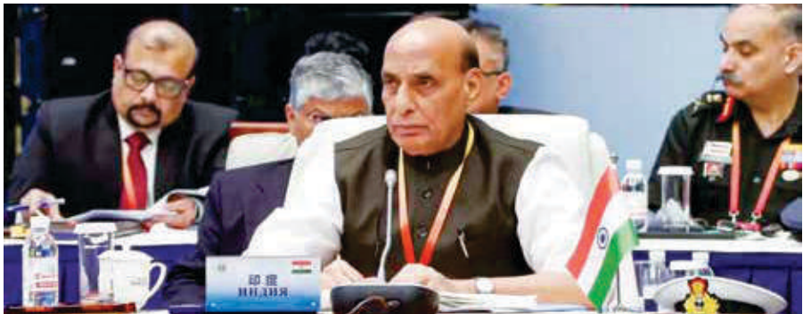
Rajnath Singh during the SCO Defence Ministers' Meeting in Qingdao, China.

clave, Singh took a swipe at Pakistan for backing terrorist groups, as he called for holding accountable the "perpetrators, organisers, financiers and sponsors" of terrorism, including cross-border terrorism.